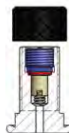
Model of valve stem integrated 7/8" 14 UNF (C)